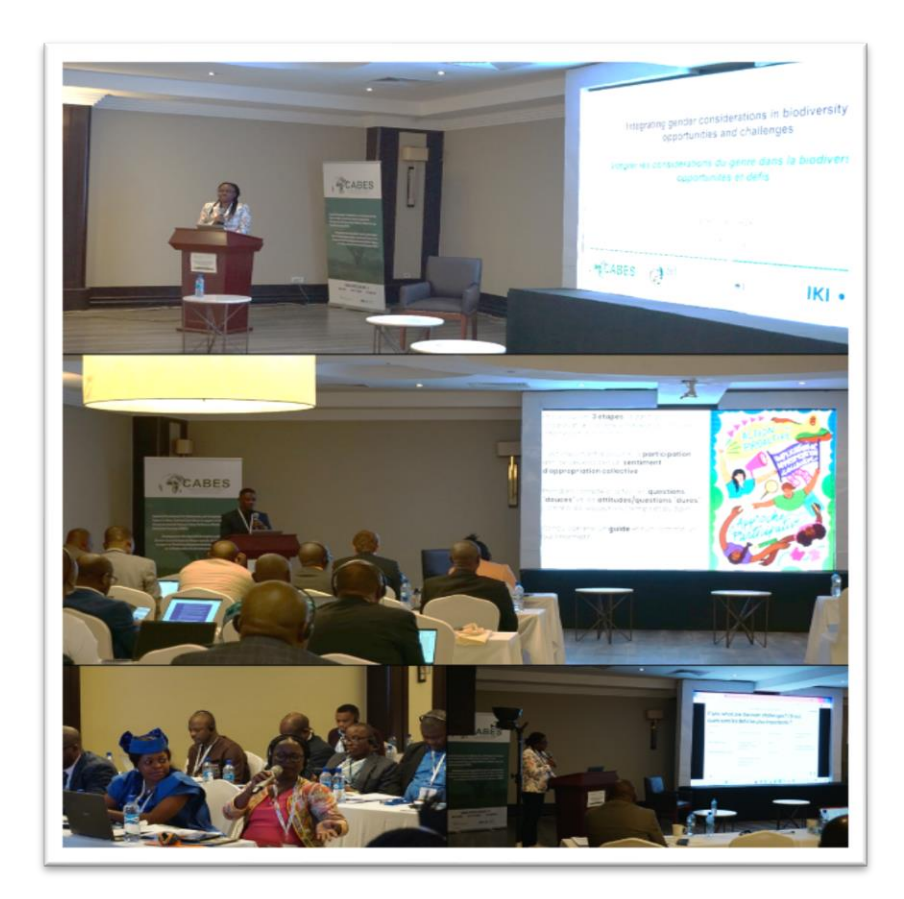
Figure 12. Illustration of presentations 5 and 6 in the afternoon of day 2.

research?" Participants were able to view the survey results in real-time, providing valuable insights into the collective perspectives of the group.