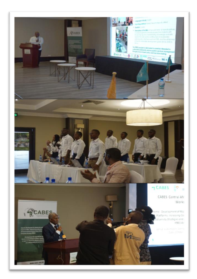
Figure 6. Photos from session 5 and speech by the Rector of the University of Lubumbashi.

Participants were then invited to the poster session, during which the 13 students from Lubumbashi's first cohort presented preliminary ideas for their research projects. The main aim of the session was to foster science-policy-practice interactions and to promote co-design and policy relevance of their planned research.