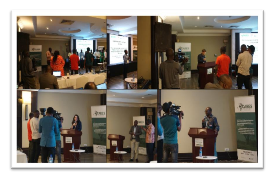
Figure 16. Illustration of the closing speeches.

The ceremony concluded with the singing of the DRC national anthem.