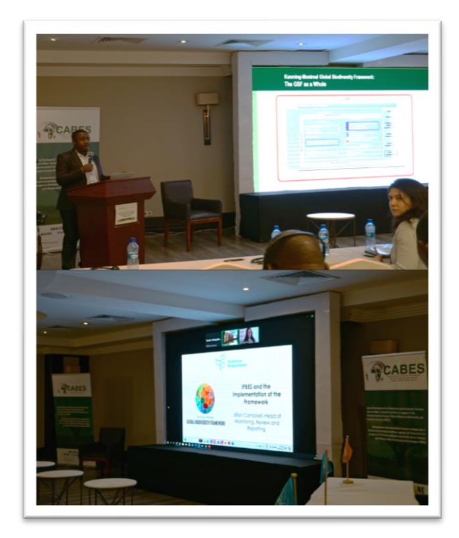
Figure 5. Presentations from session 4.

The session concluded with an engaging question-and-answer segment, allowing participants to delve deeper into the topics presented.