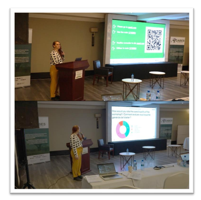
Figure 13. Illustration of the workshop evaluation session.