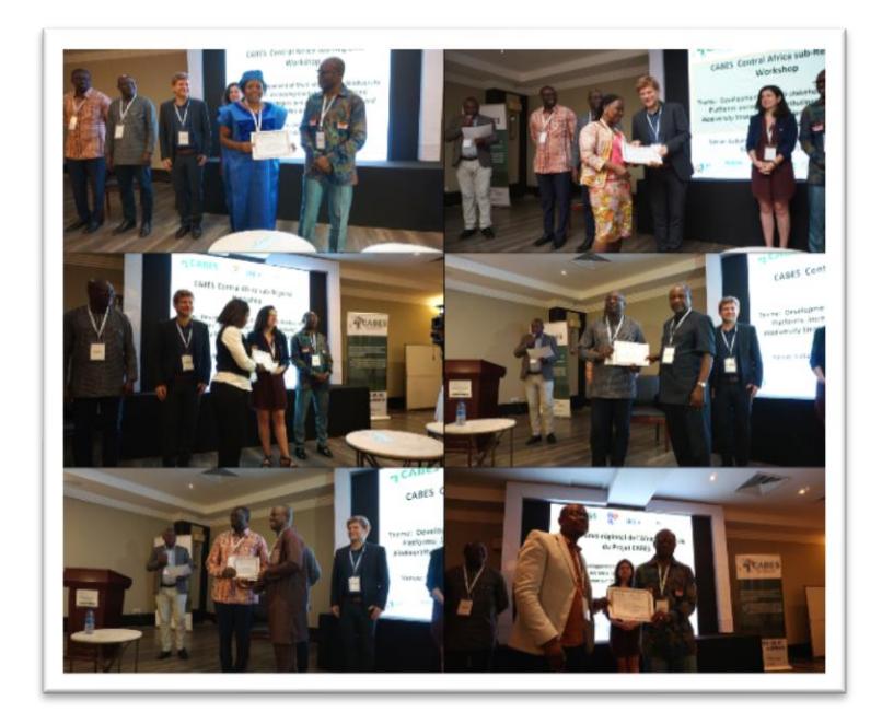
Figure 15. Illustration of the presentation of certificates.

During the ceremony, certificates were symbolically awarded to six participants, comprising three women and three men. Other participants were invited to collect their certificates immediately following the event.