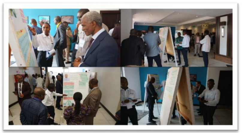
Figure 7. Some photos from the poster session focusing on the research themes of the first cohort of SPIBES Master's students at UNILU.