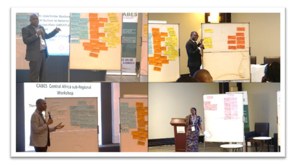
Figure 9. Some photos of the plenary ('reporting back') session